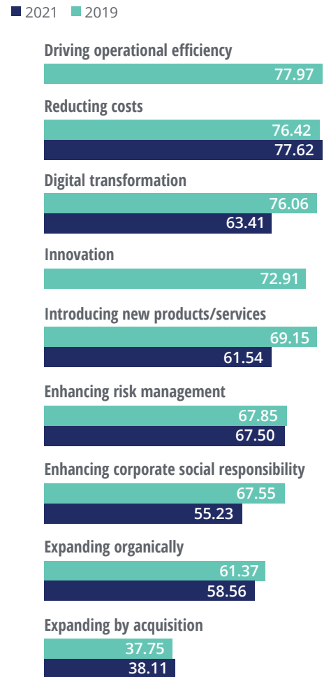
Figure 1. Changing procurement priorities Over the next 12 months, how much of a priority are each of the following business strategies?

Note: The graph follows Likert-scale weighted score.