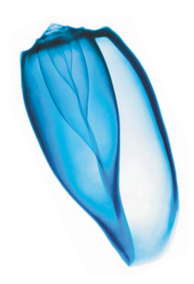
IFRSs in your pocket 2010