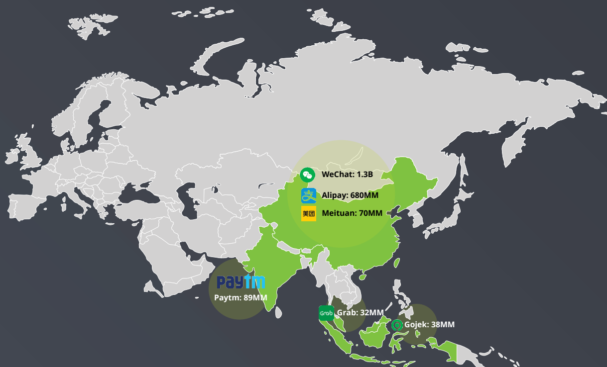
Figure 2: Monthly active users of key Asia-based super-apps, 2023